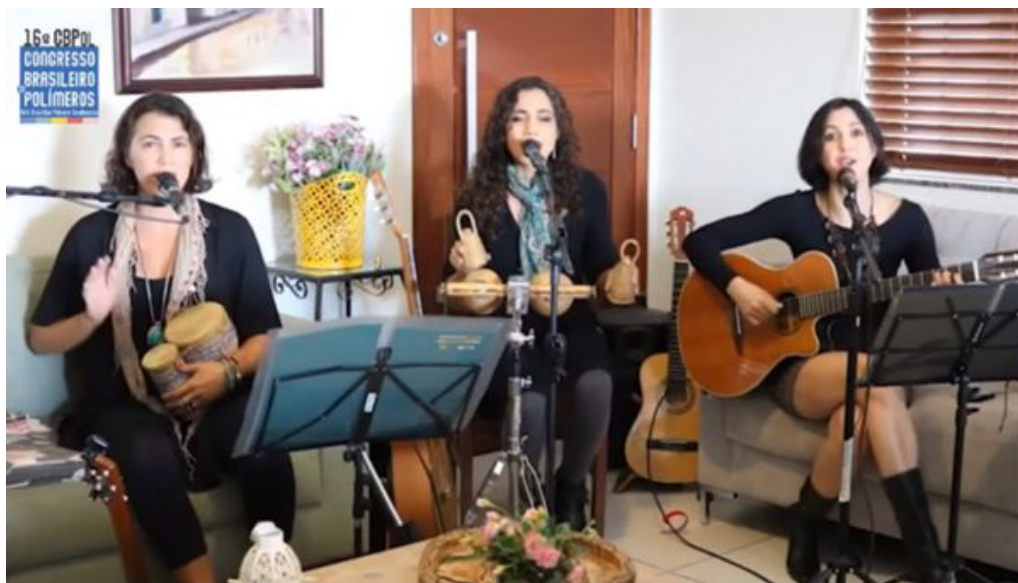
3. The concert was performed by Trio Amaranto.

The congress had 15 plenary presentations lasting 50 minutes, which featured highly prestigious speakers in the field of polymers from Brazil and abroad. In addition to the plenary sessions, 5 keynote lectures of 30 minutes and 129 oral presentations of 20 minutes each were held. The oral presentations were shown simultaneously in 5 rooms throughout the days of the event. Three (3) poster sessions of 100 posters each were held with so-called e-posters, in which the posters were viewed online together with a short presentation recorded by the authors, which remained available for conversation via the platform chat during the presentation. Seven (7) technical lectures were held during the event, covering subjects such as polymer analysis and processing techniques. During the event, 456 scientific and technical papers associated with polymers were presented. Around 198 teaching and research institutions and companies in the polymer area were represented at the event. In addition, papers from 23 different countries were presented, including countries in America (Central, South and North), Europe, Asia and Africa. In Brazil, papers from 20 different states in the 5 regions of the country were presented. These numbers demonstrate the impact of the event and its importance in national and international contexts.